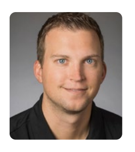
Friday, March 22 | 3:10-4:10pm Track 1 | 1 CEU Credit